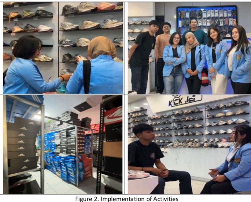
Figure 2. Implementation of Activities

Overall, Sneakers One's operational performance is quite good as it successfully adjusts inventory to match market demand. The strategy of ordering small quantities for new products demonstrates a risk management approach to prevent unsold items. Additionally, the policy of offering discounts on slow-moving and defective products helps accelerate inventory turnover, ensuring that the storage space does not become overly congested.