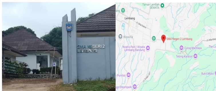
Figure 1. Location of Community Service Activities

As part of this volunteer endeavor, the group developed a cutting-edge instructional course called "Training on Accurate 5 Accounting Application for SMAN 2 Lembang Students." The main goal was to impart useful knowledge and abilities for utilizing Accurate, an accounting program that is not only frequently used in company and industry but also highly relevant for effective financial administration.