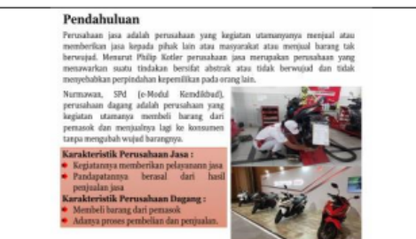
Figure 3. Display of the Introduction Discussion of the Accurate Practice Module