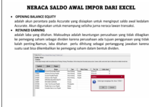
Figure 4. Initial Balance Sheet View