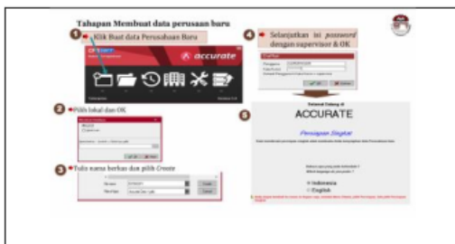
Figure 2. Accurate Application Login and Dashboard Display

SMAN 2 Lembang students would be more equipped to handle issues in the future, especially in the finance and accounting domains