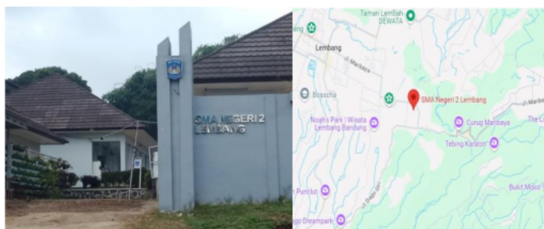
Figure 1. Location of Community Service Activities

As part of this volunteer endeavor, the group developed a cutting-edge instructional course called "Training on Accurate 5 Accounting Application for SMAN 2 Lembang Students." The main goal was to impart useful knowledge and abilities for utilizing Accurate, an accounting program that is not only frequently used in company and industry but also highly relevant for effective financial administration.