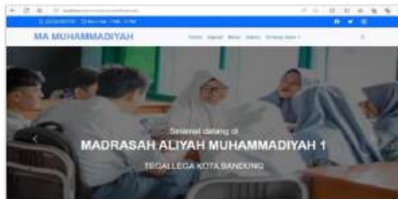
Figure 2. Main page of the MA Muhammadiyah School website

The subsequent page on the MA Muhammadiyah 1 Bandung City profile website features the principal's greeting, illustrated in figure 3.