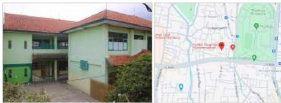
Figure 1. Location of Community Service Activities

The team has developed an original product named "MA Muhammadiyah 1 Kota Bandung Website Profile" as part of this community service project. The project's primary emphasis is MA Muhammadiyah 1 Kota Bandung, situated at Jl. Otto Iskandardinata 77B/95 Tegallega Barat, Bandung, West Java 40243. The project aims to engage participants from Formal Education Institutions / Madrasah Aliyah.