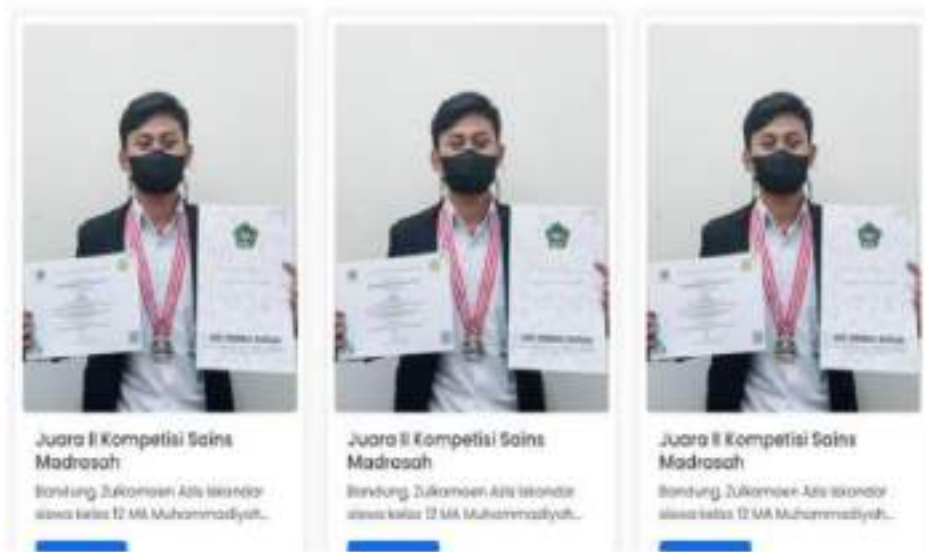
Figure 4. News display page - school achievement news

The subsequent page displayed on the MA Muhammadiyah 1 Bandung City profile website features the gallery of school events, as illustrated in figure 5.