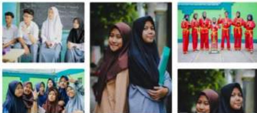
Figure 5. School activities gallery display page

The subsequent page on the MA Muhammadiyah 1 Bandung City profile website features the contact person and the school's location, as illustrated in Figure 6.