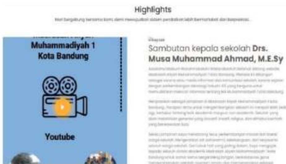
Figure 3. The principal's welcome page

The subsequent page on the MA Muhammadiyah 1 Bandung City profile website features the principal's greeting, illustrated in figure 3.