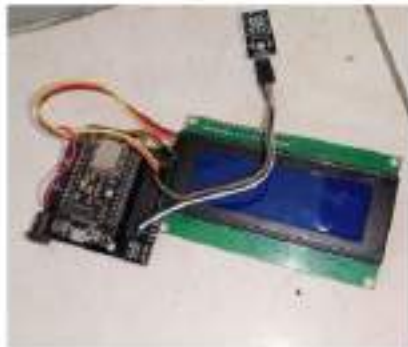
Figure 3. Control System and Non-Active Sensors