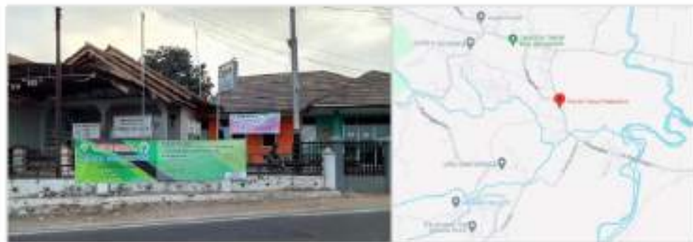
Figure 1. Location of Community Service activities

On February 19, 2024, faculty and students from STMIK Mardira Indonesia, in collaboration with Universitas Kel 2 ngsaan Republik Indonesia, executed a community service initiative as part of the Tri Dharma of Higher Education. This effort sought to help the broader community, particularly the inhabitants of Sukajadi Village, North Sumedang. The project entailed the development of an innovative device named "IoT-Based Biomass Stove." This project primarily concentrated on the Sukajadi Village community, situated in Jl. Raya Padasuka No.131, North Sumedang Subdistrict, Sumedang City. The intended participants of this project were the inhabitants of Padasuka Village, who were instrumental in overseeing the temperature of the IoT-based biomass stove.