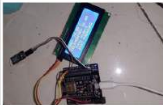
Figure 4. Active Control and Sensor System