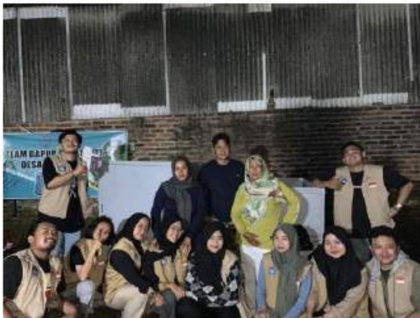
Figure 7 IoT Based Biomass Stove Testing

Figure 7 illustrates the evaluation of the effective deployment of the IoT-based biomass burner developed by faculty and students from STMIK Mardira alongside the apparatus from Padasuka village.