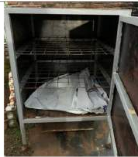
Figure 6. Physical Open Biomass Stove

This project involved developing an IoT-enabled biomass burner equipped with temperature sensors to monitor real-time temperature and display indicators, allowing users to maintain a consistent temperature remotely. Figure 2 depicts the wireframe design of the IoT biomass stove, Figure 3 represents the inactive control system and sensors, Figure 4 exhibits the active control system and sensors, Figure 5 reveals the closed physical biomass stove, and Figure 6 demonstrates the open physical biomass stove.