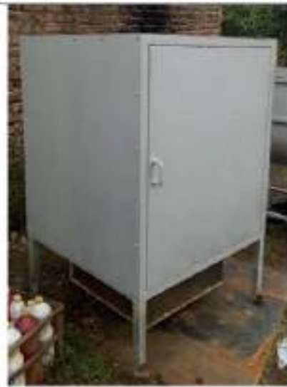
Figure 5. Physical closed biomass stove